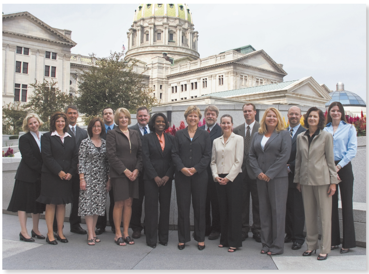
The Staff of the Independent Regulatory Review Commission

We appreciate constructive criticism. This applies to our seminars, our website and public meeting format. We welcome your suggestions for improving any of these items.