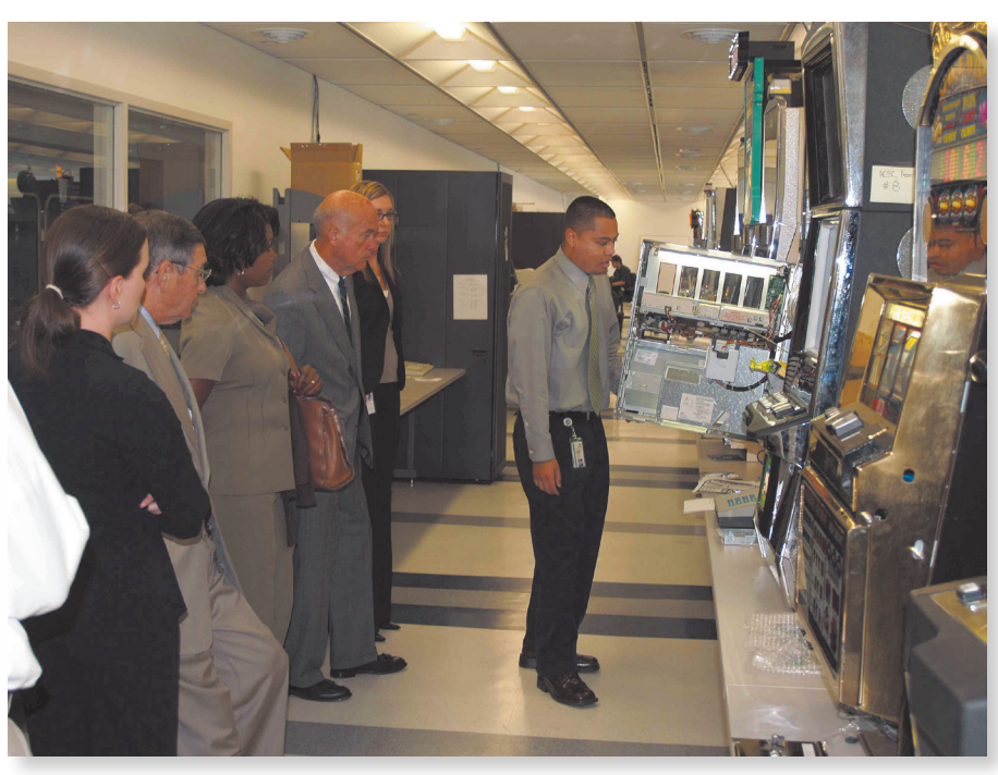
IRRC Commissioners and Staff visit the Gaming Control Board's Bureau of Gaming Laboratory Operations