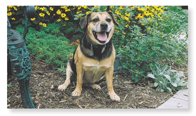
The Department of Agriculture's Dog Law Enforcement Regulation

upcoming public meeting dates and agendas. In addition to Commission comments, you are now able to view all comments IRRC has received on any given regulation. Announcements about regulatory review process seminars that we are holding during the year and all IRRC publications are also available on the website. We have revised and updated our process manual, The Regulatory Review Process in Pennsylvania, which contains a comprehensive explanation of the regulatory review process. We published our inaugural newsletter Common Ground in August. We plan to publish this newsletter biannually.